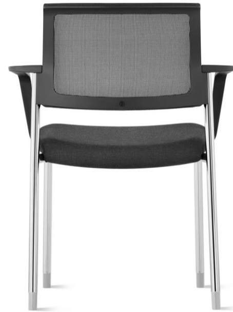
Verus Guest Chair