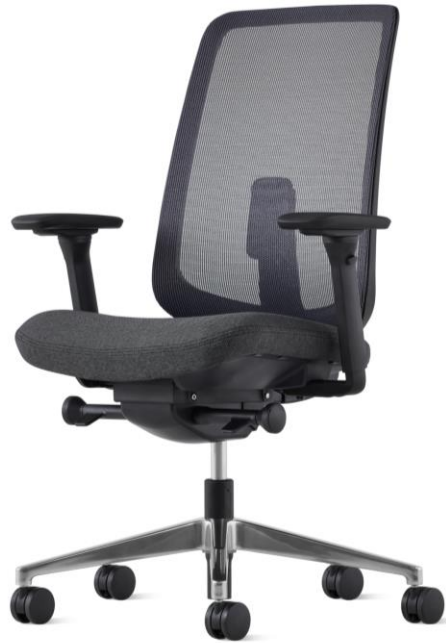
Verus Task Chair